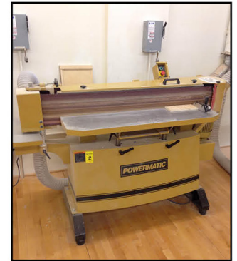
4. Sanded Bridges with Edge Sander