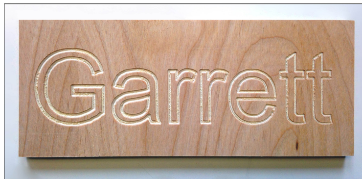
CNC Name Plate: Finished Result

Process: CNC Router (subtractive fabrication)