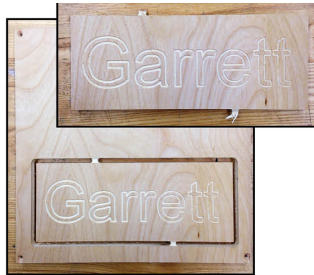
3. Removed from Router & Popped Out Bridges